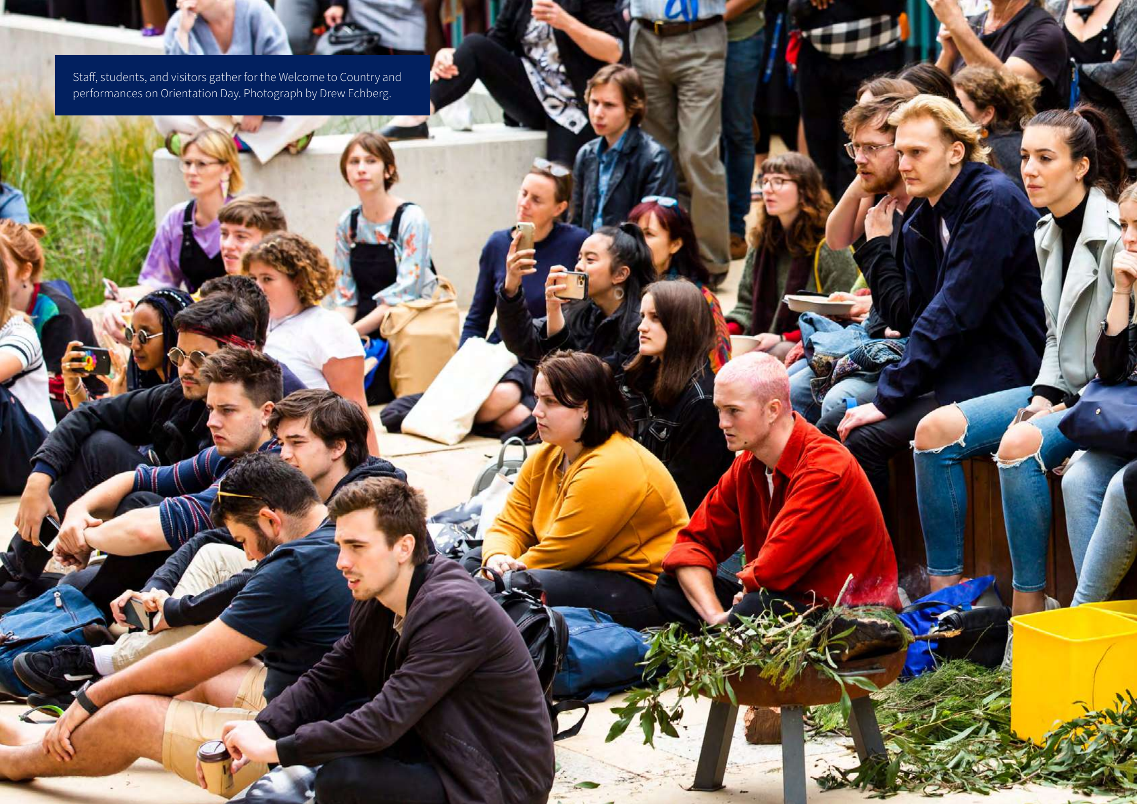
Staff, students, and visitors gather for the Welcome to Country and performances on Orientation Day.